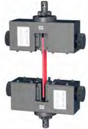
Screw Action Grips