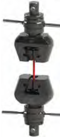
Wedge Action Grips