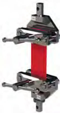
Side Action Grips