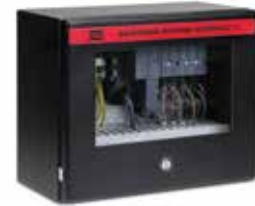
MTS SafeGuard 275.295 Machine Interface for the MTS Series 295 HSM