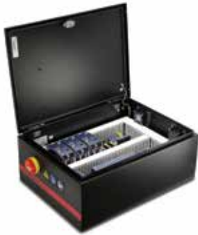
MTS SafeGuard 273 Processor