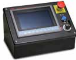
MTS SafeGuard 274 User Interface